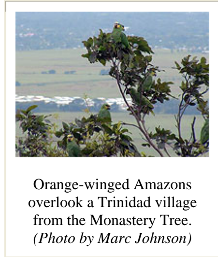
Orange-winged Amazons overlook a Trinidad village from the Monastery Tree.

The myth that we need to breed them in captivity in order to "save" them is one myth that is being debunked every day all over the world. In fact, it is the very pet trade itself that is probably most responsible for the desperate situation many parrots find themselves in today, and sadly, the pet trade is still at work in places like Guyana, one of the largest legal exporters of parrots in the world.