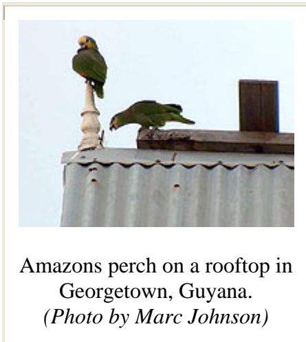
Amazons perch on a rooftop in Georgetown, Guyana.

Many species of parrots are adapting and finding that our agricultural efforts are perfectly acceptable habitats to the unfortunate point where many hundreds of thousands are now considered pests and killed. In Australia, cockatoos, by the hundreds of thousands, are killed, and in Trinidad, local farmers are shooting Orange-winged Amazons, who raid their cash crops. Demands by an ever-growing human population for housing, agriculture, and industry will, in time, threaten ever-growing areas that parrots call home, and many species of parrot will not be able to adapt; but many more will find that our world suits them just fine. Just like the birds in our backyards — hawks and cardinals — parrots will adapt and become successful at surviving