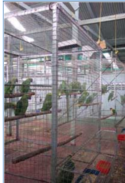
Wild Amazon parrots captured for the pet trade await exportation in Georgetown, Guyana.

"Foster Parrots and our supporters have a rare and important opportunity to play a pivotal role in influencing the expansion of protected territory in a country whose natural resources have experienced decades of mismanagement and exploitation," he said.