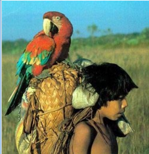
A green-wing macaw hitches a ride from an Amerindian boy in Guyana.