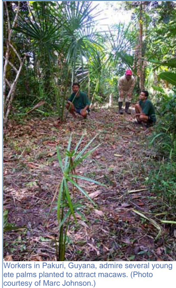
Workers in Pakuri, Guyana, admire several young ete palms planted to attract macaws.