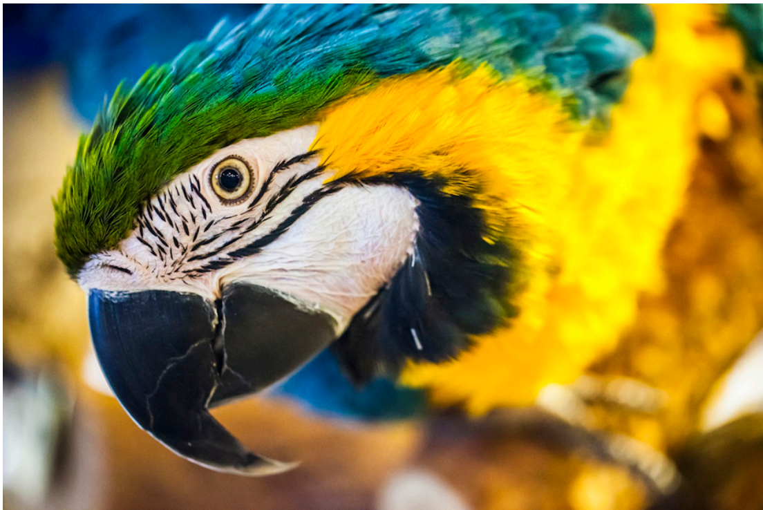
Blue & Gold Macaw, "Bugsy" by Eli Ackerstein